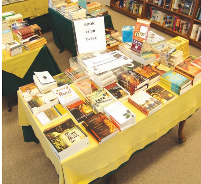
Book Club selection at Orinda Books

Lamorinda bookstores make a real effort to support book clubs. Not only is it good for business, but it's a great way to connect with the community. Merchants know that with amazon.com, Costco, Barnes & Noble and the like, it's getting increasingly difficult for an independent book seller to stay in business. What sets our bookstores apart is their wonderful customer service and loyal patrons. One of the first local bookstores to encourage the development of book clubs as we know them today was Orinda Books.